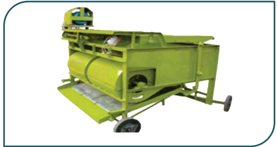
Grain Winnower/Paddy Cleaner