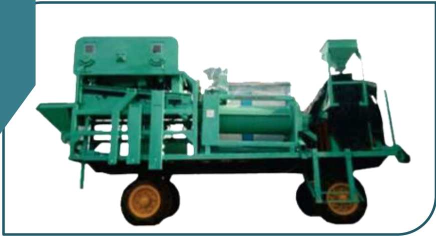
Mobile Seed Processing Plant